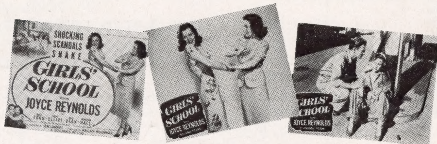
EIGHT 11 x 14's